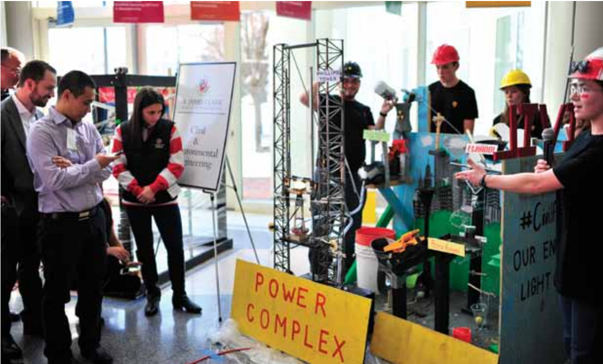
The 2015 CEE Alumni Cup team paid homage to environmental engineering with their entry in the annual design competition. Started in 2012 by the University of Maryland Alumni Association, Engineering Chapter, the Alumni Cup takes place each year during National Engineers Week, a weeklong celebration held to increase awareness of the field for the general public, students, educators and parents.